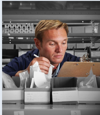
The Old Way