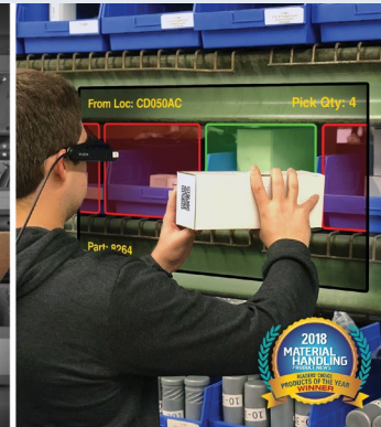
The LogistiVIEW Way